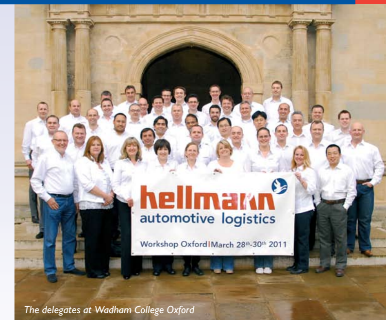
The delegates at Wadham College Oxford

The tremendous growth despite emerging from a global recession is testimony of the commitment and hard work of everyone within the organisation. Building on the conference motto of last year 'Customer Retention – how do we earn the next contract?' the new motto this year is 'Customer Satisfaction – how can we continuously improve the quality of our services?'